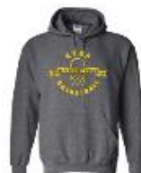
63an Youth or Adult hood $21.00 SKU: 18500 SCR Design 096403