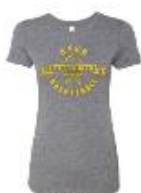
Next Love Women's 63 T/ Blend Tee $16.00 SKU: 6710 SCR Design 096403