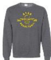
63an Youth or Adult Crew Neck Sweatshirt $19.00 SKU: 18000 SCR Design 096403