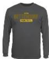
63dn Youth or Adult LS Tee $17.00 SKU: 5104 SCR Design 090386