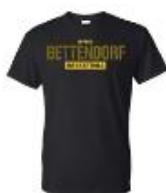
63dn Youth or Adult 63 Tee $13.00 SKU: 8000 SCR Design 090386