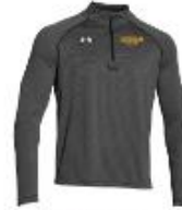
Under Armour Men's Striped 3/4 Zip $37.00 SKU: 1276228 EMB Design 090411