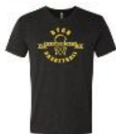
Next Love Men's 63 T/ Blend Tee $16.00 SKU: 6010n SCR Design 096403

We have made every attempt to create flyers free from errors. However, we do reserve the right to correct pricing errors. Color choices may also vary when printed on paper compared to actual fabric.